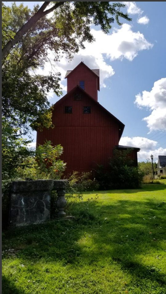
Farm in Jericho, Vermont