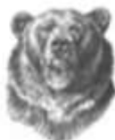
Houston County High