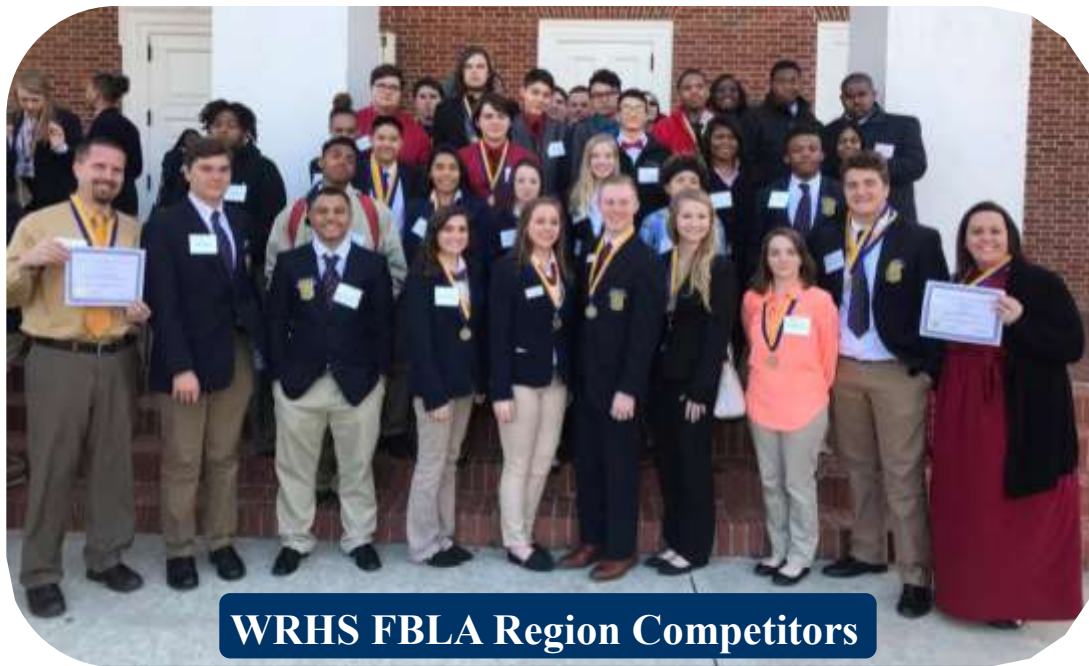
WRHS FBLA Region Competitors

Several students from Warner Robins High School received region recognition at the Awards of Excellence Program.