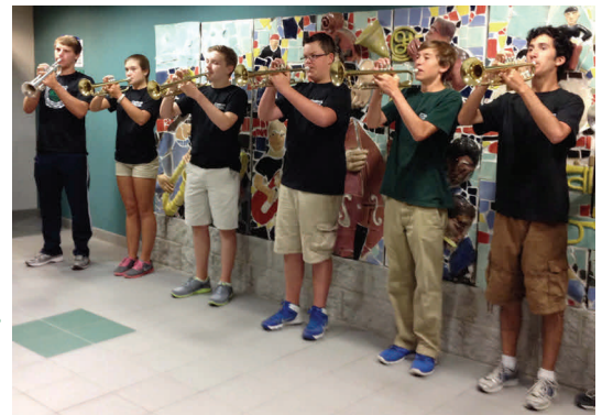
Trumpeters from the NMHS band welcome New Milford Public Schools staff to the annual meeting on August 22nd.