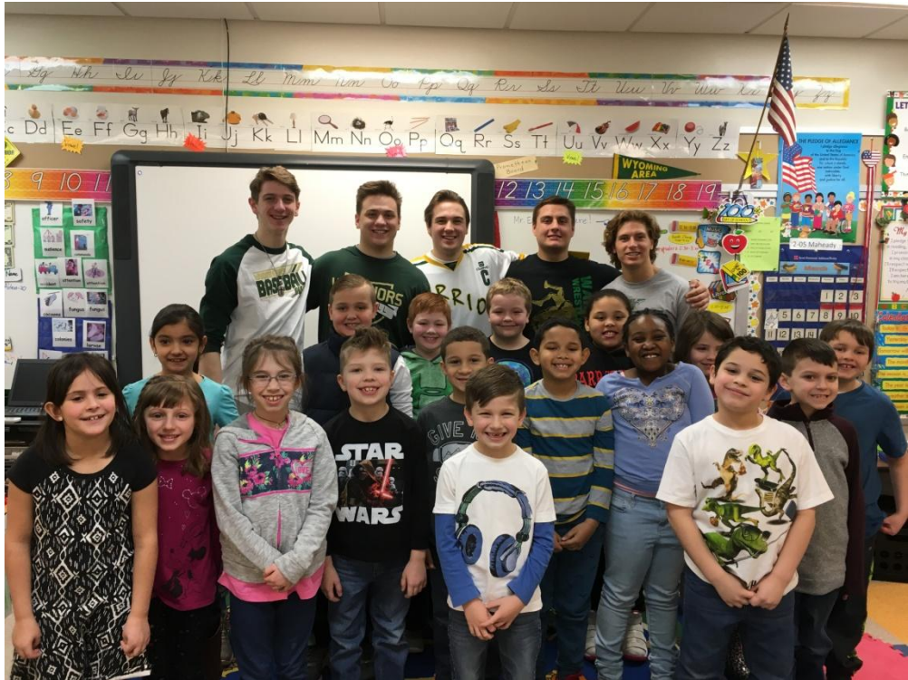
Exeter, PA. March 27, 2018