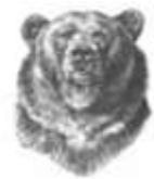
Houston County High