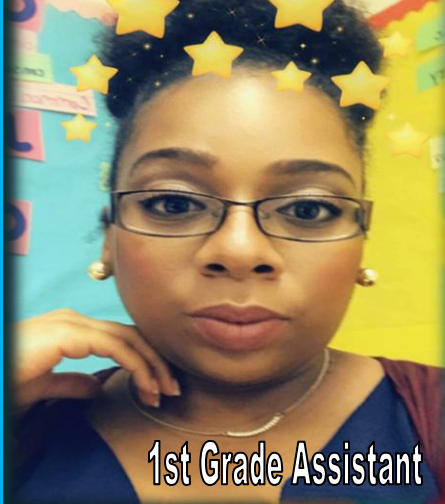
1st Grade Assistant