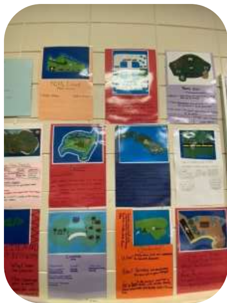
Pictured at left is a poster the Marketing Education students completed and have hung for display in the classroom.