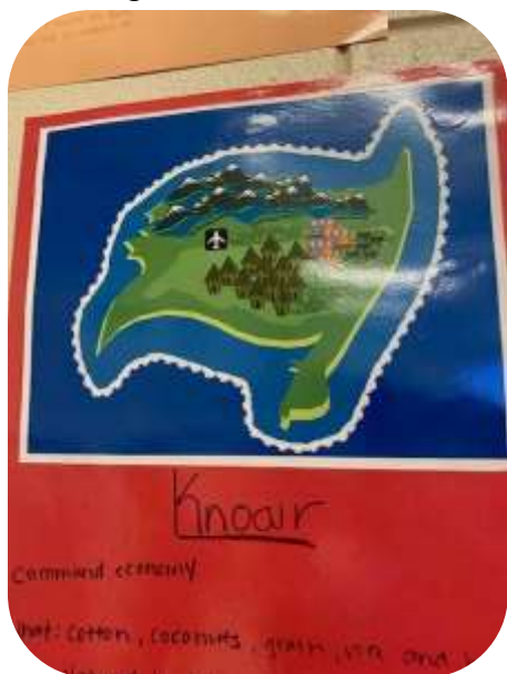
Pictured are images of the finished digital islands.