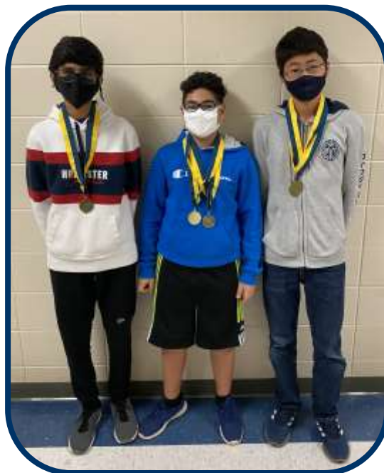
Thomson Middle School Region 5 Winners