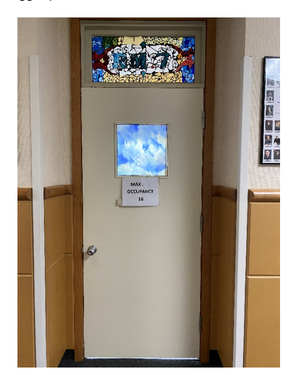
Doors become scratched and worn over time. Now they look like new.

Knappa School District #4 41535 Old Hwy 30, Astoria, OR 97103 www.knappa.k12.or.us