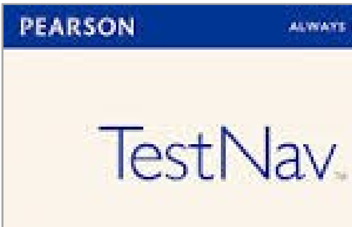
Figure 1. Test Nav Loading Image