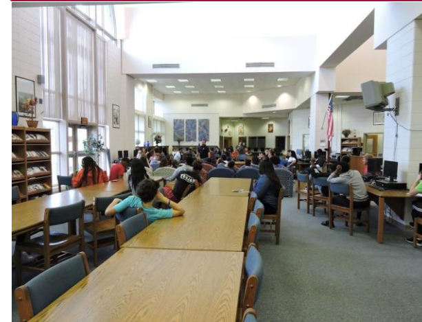
Students in the Media Center listen attentively to a guest speaker.