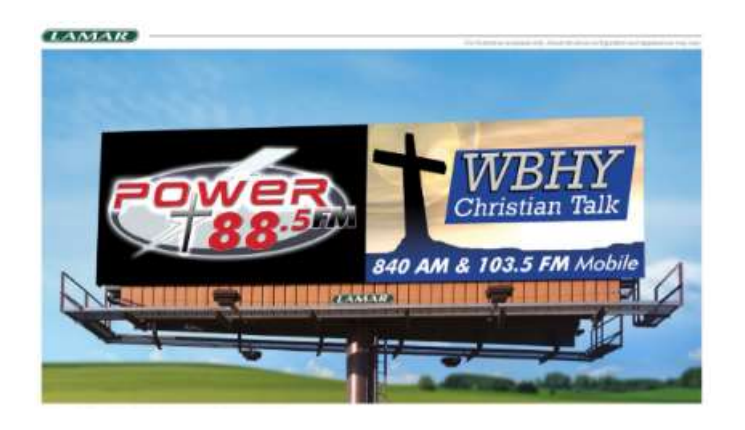
It is easy to "Give where you get your blessings!"

We are debtors, to proclaim the Gospel by the electronic media, as trustees of our stations. God has given us influence beyond anything our natural abilities or personal goals would suggest.