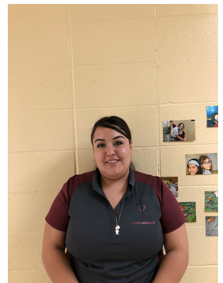
Karely Venegas Elementary Pod