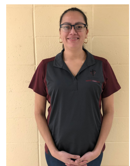
Michelle Moreno Jr. High Pod