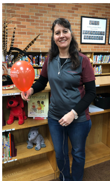
Lupita Alvarez Elementary Pod