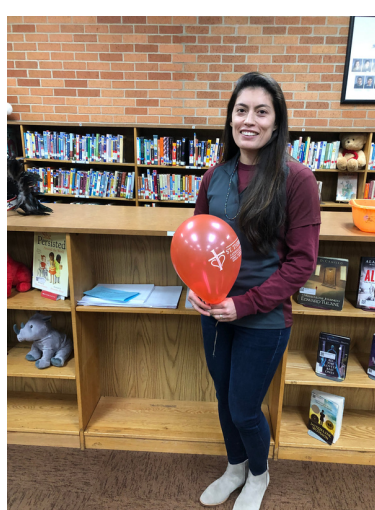
Adela Rodriquez Middle School & Jr. High Pod