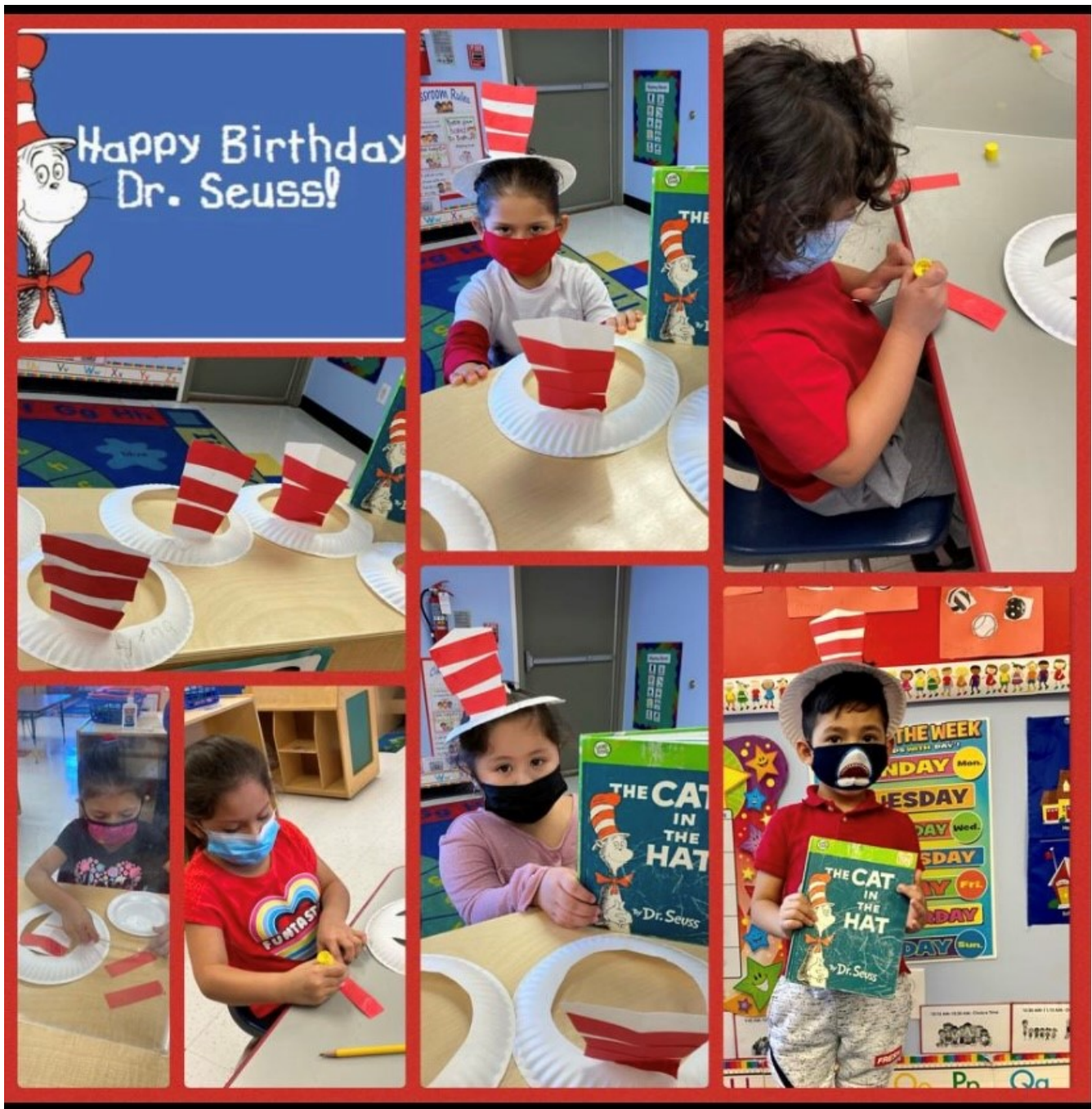
Children at the Twin Rivers Head Start Center celebrated Dr. Seuss' birthday by reading "The Cat In The Hat" and making their very own hats out of paper plates.