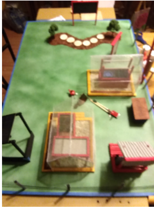
Model of the Outdoor Learning Center Project:

Big changes are happening in the Frazier Elementary Aquaponics Greenhouse! The development of an Outdoor Learning Center for the Elementary. It will be equipped with a classroom area, weather station and planting area. Grade levels will also enjoy the use of grow boxes for vegetable gardens, butterfly gardens or salsa gardens. A “Winterized Greenhouse” for Kale and Spinach will be used to experiment with plants that can survive the winter and be harvested in January.