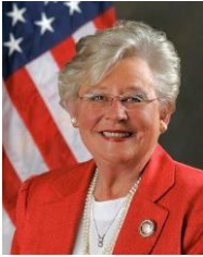
Kay Ivey, Governor President