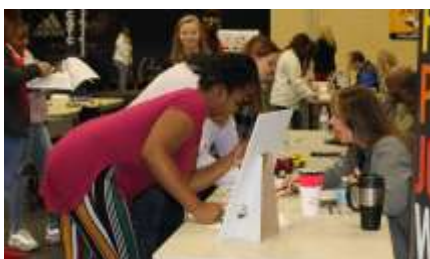
Student participants are pictured at left.