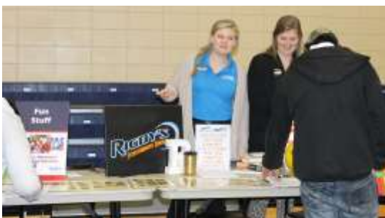
Rigby's representatives are pictured above.