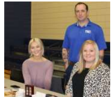
Buzzell Plumbing, Heating and Air representatives are pictured above.