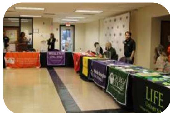
Pictured are vendors ready to greet students.