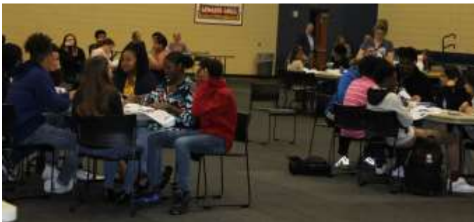
Pictured at left are student participants.

Northside High School and Warner Robins High School were able to take part in the same event on March 4th, which was held at the Cary Martin Conference Center.