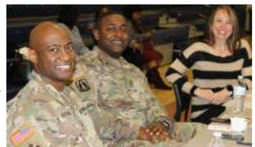
Pictured at right are military and business representatives.