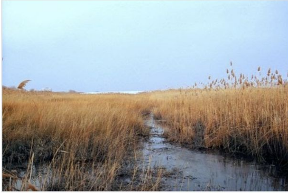
The Meadowlands in New Jersey