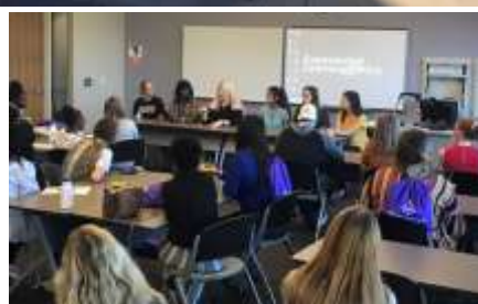
Above, TAAP students are pictured as they listen to a panel of MGA Education major seniors.