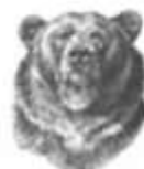
Houston County High