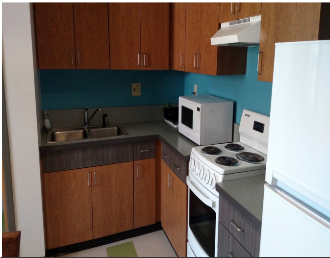
Independent Living Apartment Kitchen Area