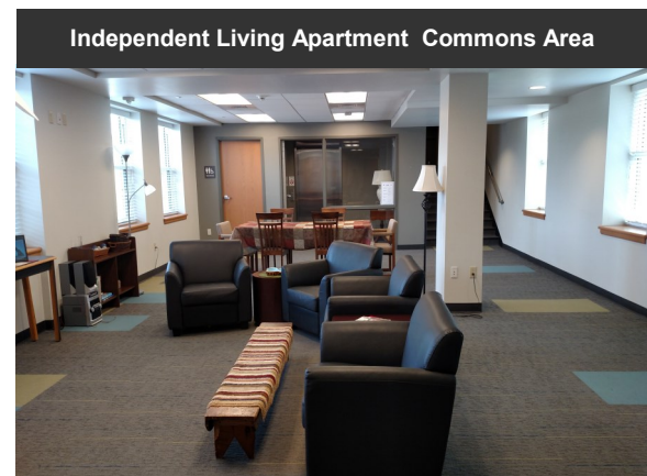
Independent Living Apartment Commons Area