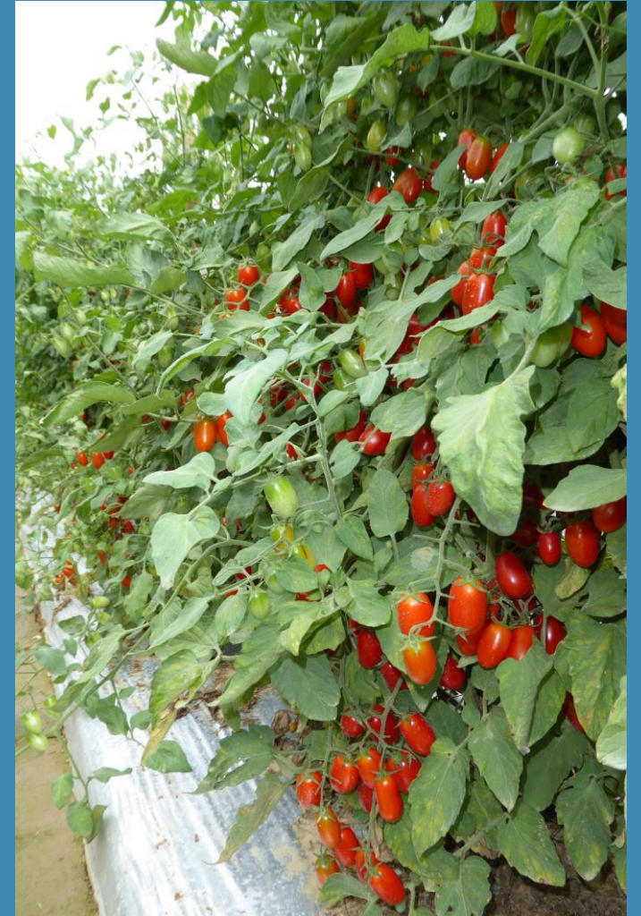
Grape Tomatoes at J&J Tomatoes

Grape Tomatoes are sourced from: J&J Tomatoes, Anniston, AL