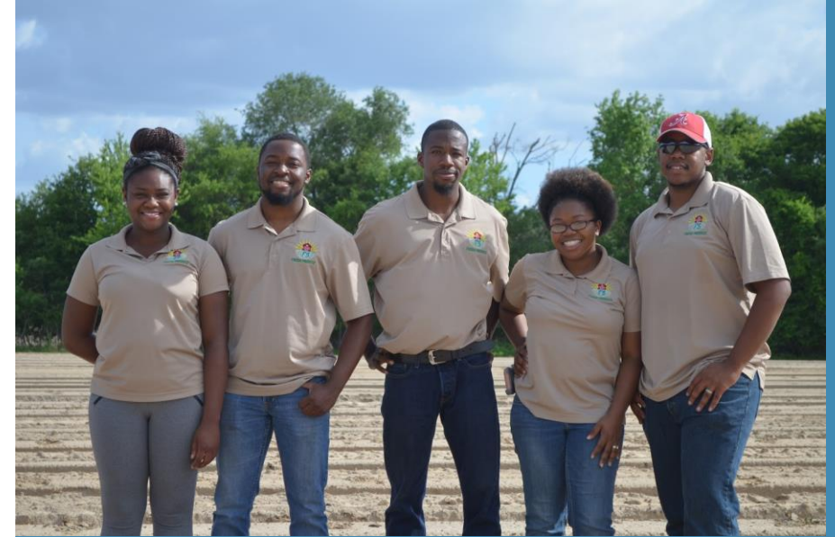
Farmers 5 Fresh Produce

Please Note: the USDA Foods Product Information Sheet contains information on 30# cases, Alabama DoD Fresh produce will be packaged in 40# cases