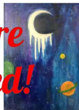
Eyla Wood-O'Toole, 6th Grade

Date of the Exhibition: January 5-February 3, 2019