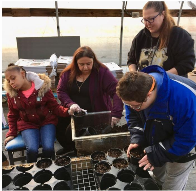
Students from the Salem Special Services School District filled pots for our spring tomato crops.