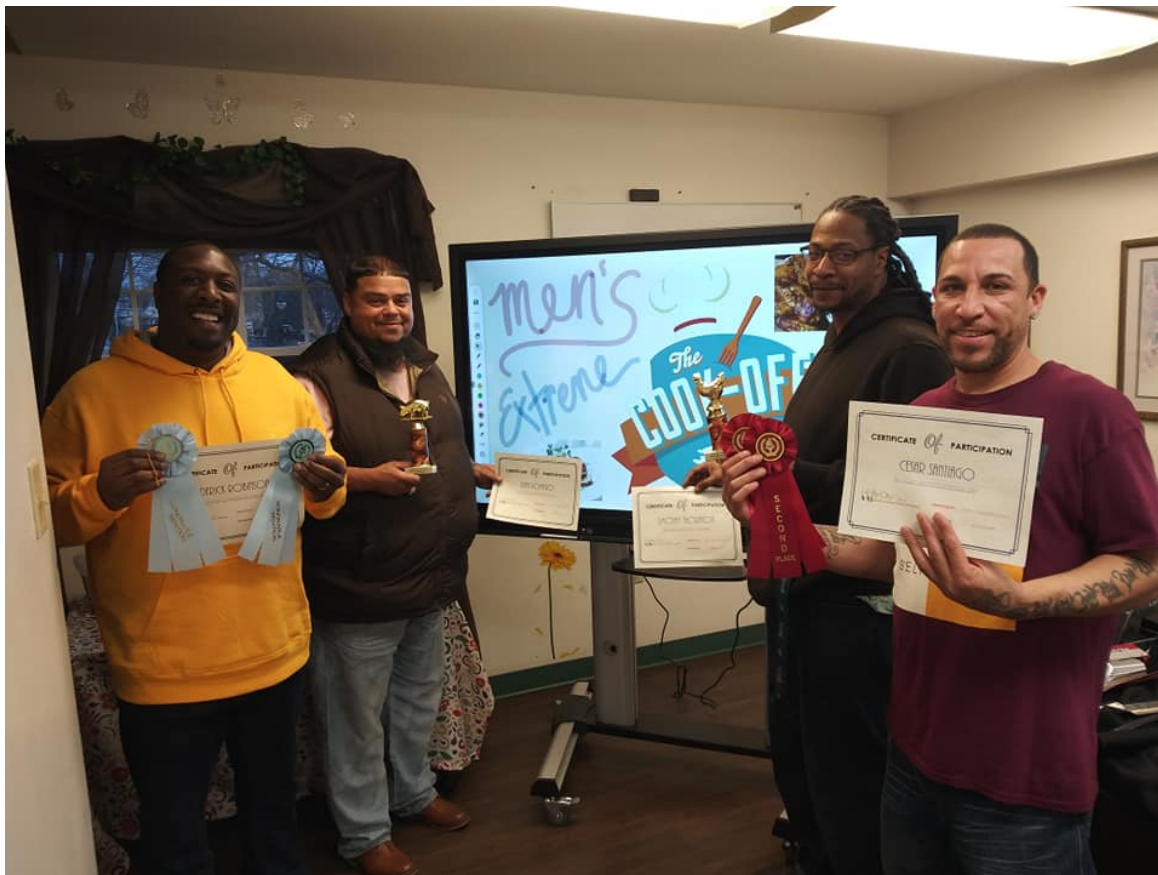
Men's winners in the Holly City Family Success Center of Millville's Extreme Cook-Off.