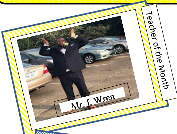
Teacher of the Month