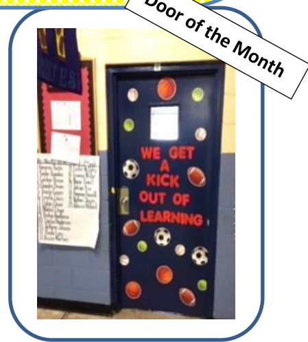
Door of the Month