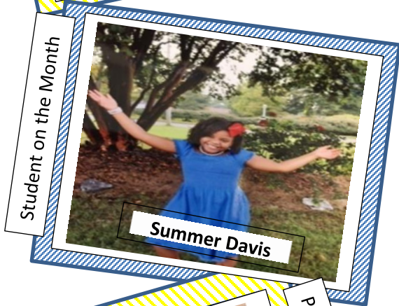
Student of the Month