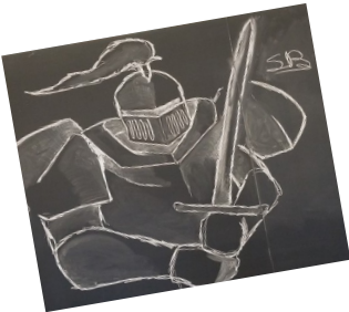
Art from PHS students